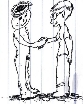
Illustration courtesy of Jimmy the Beak

EOS: So what made you join a ship and set out?